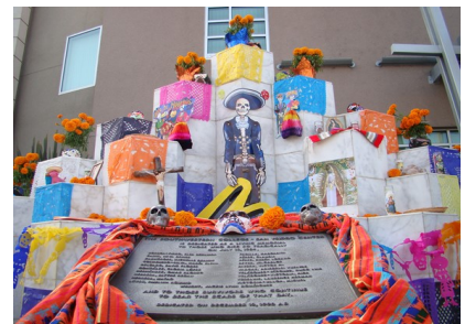
HECSY Memorial November 2, 2017 decorated by Child Development Club.

Papel Picado is tissue-like paper used to make beautiful art pieces and banners in various colors.