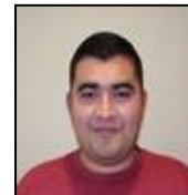
Fernando Lopez Computer Lab (2nd Floor)