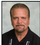
Steven Kean Library (1st Floor)

Tuesday: 2:00–4:30 p.m. Wednesday: 2:30–5:00 p.m.