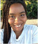
Trena Marshall Library (1st Floor)

Wednesday and Thursday: 11:00 a.m. – 1:30 p.m.