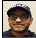
Edward Nava Library (1st Floor)

Tuesday and Thursday: 1:00 p.m. – 3:30 p.m.