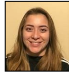
Leslie Santana Verduzco Library (1st Floor)

Tuesday and Wednesday 11:00 a.m. – 1:30 p.m.