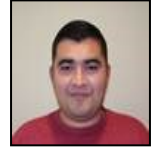
Fernando Lopez Computer Lab (2nd Floor)

Monday - Thursday 10:30 a.m. - 3:30 p.m.