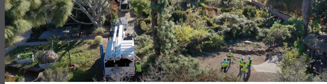
Workers prepare to move specimen trees to preserve them while construction continues on the new Landscape and Nursery Techology project.

Project Budget: $1.9 million. Project Status: In design