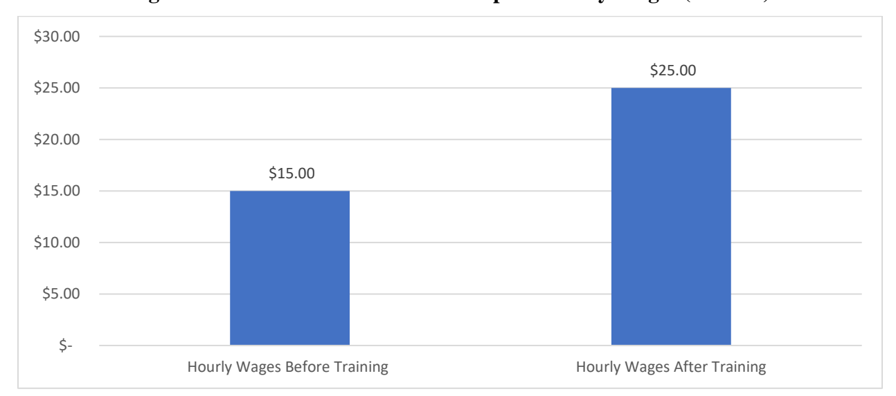
Figure 2 Southwestern CTEOS Participant Hourly Wages (N = 456)

Figure 2 shows that CE students increased their hourly wages by $10.00 after receiving training at SWCCD.