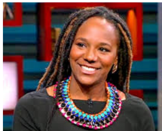
Bree Newsome Bass

Pre-Registration Required. Event open for SWC only.