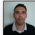
Alberto Lombardo Computer Lab

Monday, 9:30 a.m.–1:00 p.m. 3:15–6:45 p.m. Tuesday, 9:30 a.m.–1:30 p.m. Thursday, 9:30 a.m.–1:30 p.m.