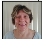
Christie Matalka Library—1st floor

Monday 2:30–5:30 p.m. Wednesday 8:00 a.m.–12:00 p.m. Thursday 11:00 a.m.–2:00 p.m.