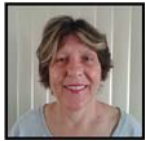
Christie Library—1st floor

Monday 9:00 a.m.–2:00 p.m. Thursday 11:00 a.m.–4:00 p.m.