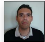
Alberto Computer Lab

Monday, 9:30 a.m.–1:00 p.m. 3:30–7:00 p.m. Tuesday, 9:30 a.m.–1:30 p.m. Thursday, 9:30 a.m.–1:30 p.m.