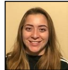
Leslie Santana Verduzco Library (1st Floor)

Tuesday and Wednesday 11:00 a.m. – 1:30 p.m.