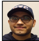
Edward Nava Library (1st Floor)

Tuesday and Thursday: 1:00 p.m. – 3:30 p.m.