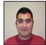
Fernando Lopez Computer Lab (2nd Floor)

Monday - Thursday 10:30 a.m. - 3:30 p.m.