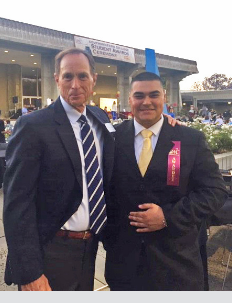
Devore Family Memorial Scholarship presented to SWC student who went on to graduate from SDSU

perhaps, the most impactful type of contribution in higher education. These funds are made up of financial gifts that are invested for growth with the option to have them endowed, allowing donors to create living legacies that span generations.